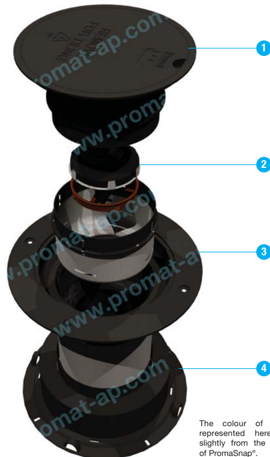
The colour of the product represented here may vary slightly from the actual colour of PrumaSnap®.

If, for any reason, the pipe or closer device need to be cleaned, the closer device is simply and quickly removed through the floor grate opening. After cleaning, the closer device is replaced by pushing downwards and clicking firmly in to place. Replacement units are available from Promat.